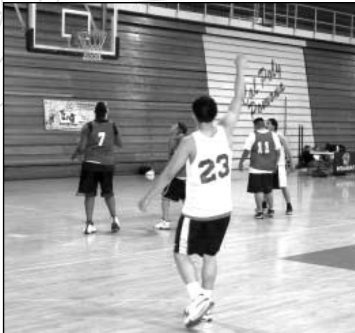
Intramural basketball league participants at the Kellogg Gym.

Recreational Sports reintroduced tournaments to our programs beginning late in the Winter Quarter. Tournaments included racquetball, tennis, three-point shooting Contest and soccer. About 150 participants were served.