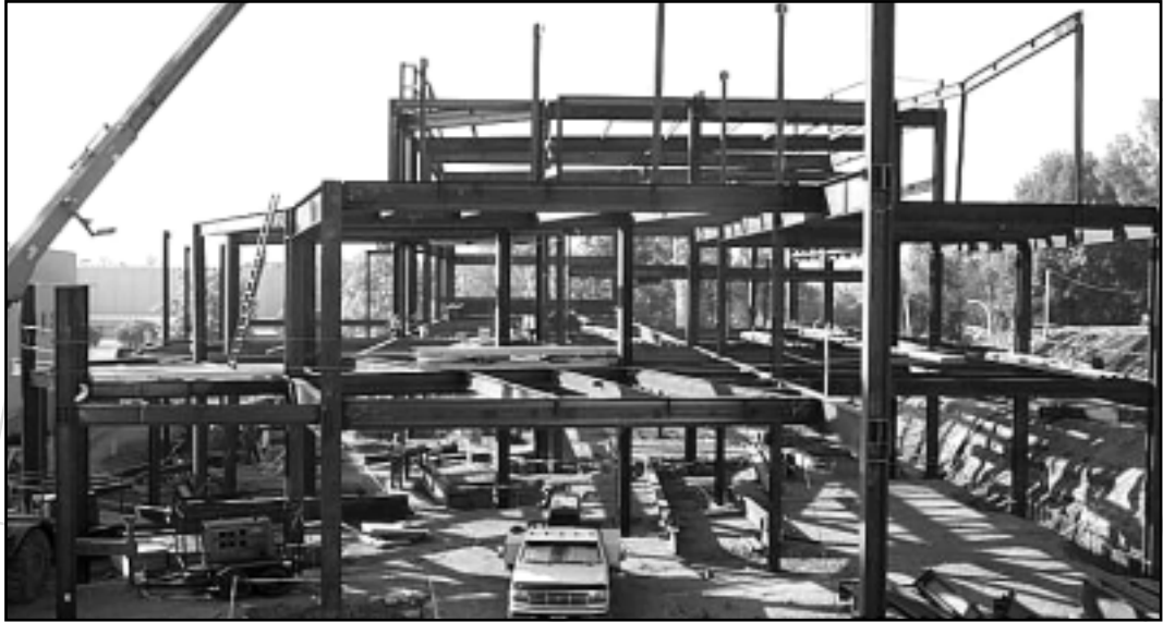
After: Summer 2001