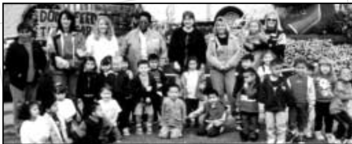
Children's Center teachers and students.

In a continuing partnership between the University and ASI, the Children's Center served students, faculty, staff, alumni and community residents who have children. Offering a developmental program with attention to the individual needs of each child, the Center served more than 100 children during the past academic year. Highlights of the past year include: