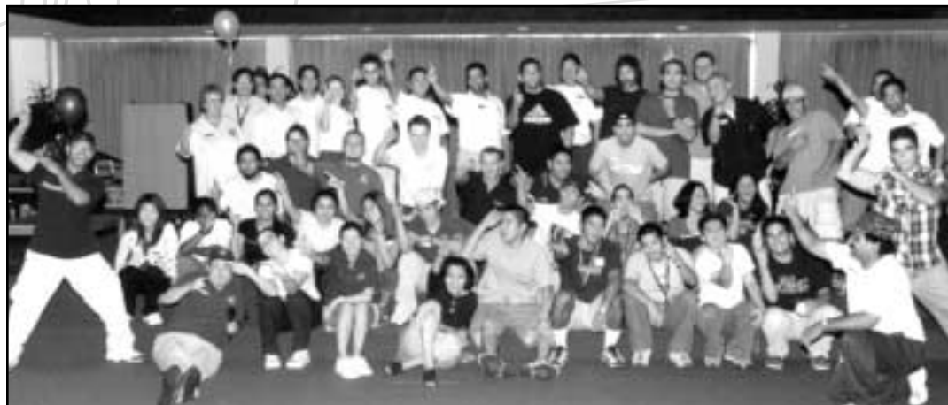
ASI Staff Orientation, "to Infinity and Beyond," in September 2000.

Investing in its future and in the building blocks of its organiza-