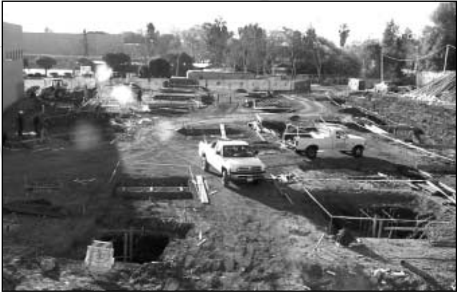
Before: Summer 2000