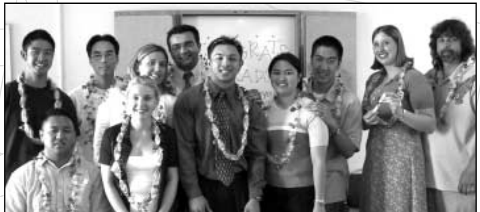
Proud and happy ASI Graduates, members of the Class of 2001