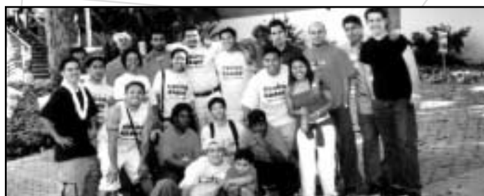
Cal Poly Pomona students come together following the ASI elections.

The leaders of student government were concerned about getting improvements made on campus that would be beneficial to all members of the Cal Poly Pomona community. Improvements such as a one-million dollar allocation for campus lighting to IMPROVE SAFETY and a CREDIT CARD AWARENESS PROGRAM to increase student awareness about the risk of student debt were accomplished.